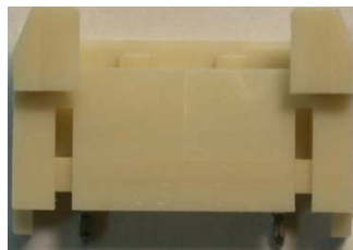
SM02 (8.0)B-BDBS-1 (Pin1)